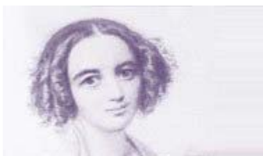
THE BEST YEAR OF MY LIFE FRI 15 MAY 6PM