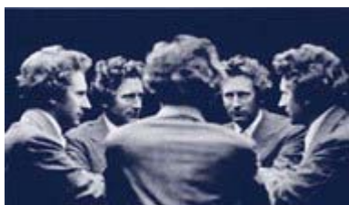
BACH, GRAINGER GRIEG THURS 14 MAY 6PM