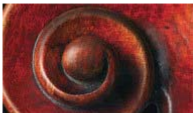
THE HISTORY OF SOUND WED 6 MAY 6pm