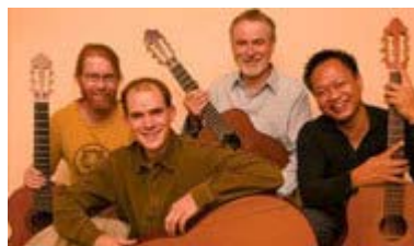
MUSICA DEL FUEGO FRI 8 MAY 6PM