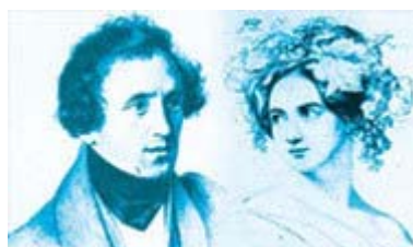
LOVE LETTERS TUES 12 MAY 8PM