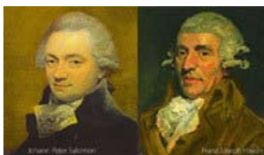
HAYDN'S SURPRISE SAT 9 MAY 8PM