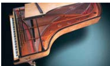
SOMETHING FRENCH SOMETHING LUSCIOUS TUES 12 MAY 6PM