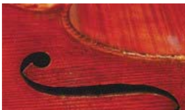
THE CANBERRA TIMES OPENING GALA THURS 7 MAY 8PM